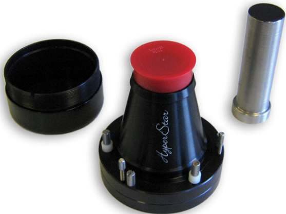
Secondary holder, HyperStar lens, and counterweight